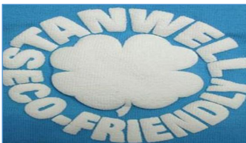
Fig 1.2 Puff Prints

Puff Printing – It is a type of printing in which the ink used raises above the surface adding texture and density, giving the garment a three-dimensional type of look. It is created by combining regular plastisol ink with a puff ink additive. Once the design is created, the garments are properly cured. After it is exposed to the high temperature, the puff ink raises above the surface. The additive added to the plastisol ink allows the printout to rise giving a 3D feel. High viscosity inks are used in this printing process. After drying and heating the printed area becomes puffy and that is why this printing process is called as Puff Print. It is important to reach the recommended temperature to ensure proper curing; if the cured print cracks when folded it is probably not cured properly.