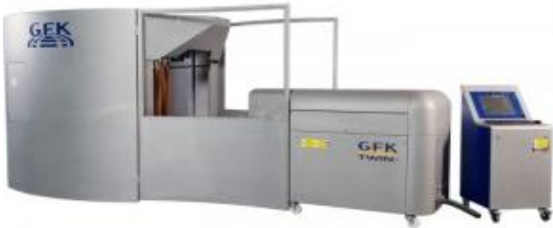
3e textile laser

A knowledge sharing initiative of Resil Chemicals. For queries, please write to arc@resil.com . Also, visit www.resil.com